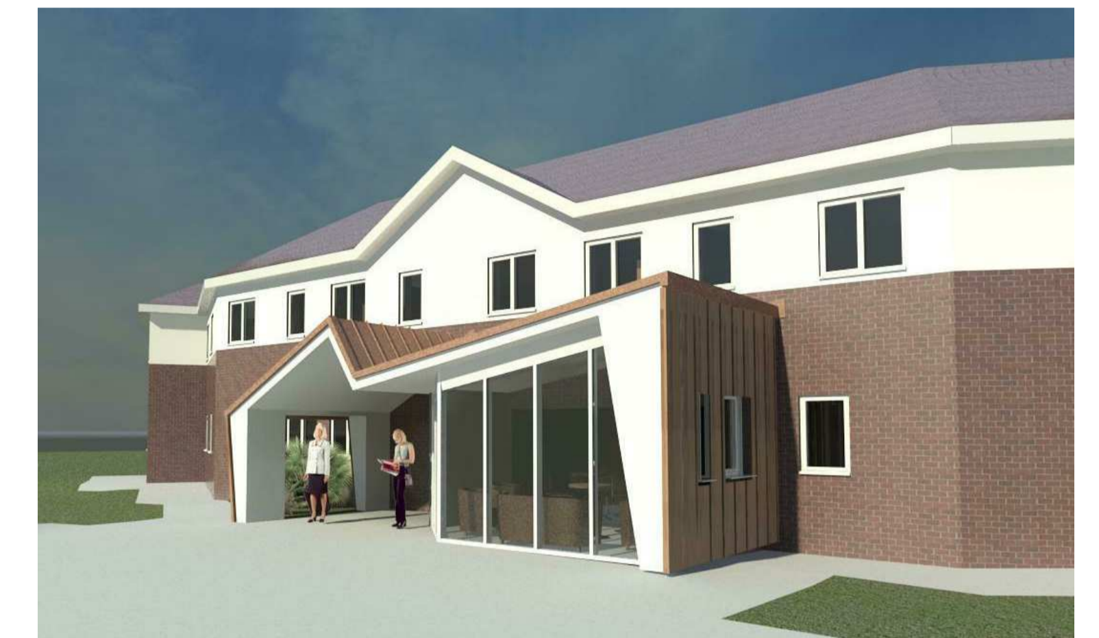
Perspective - proposed main entrance